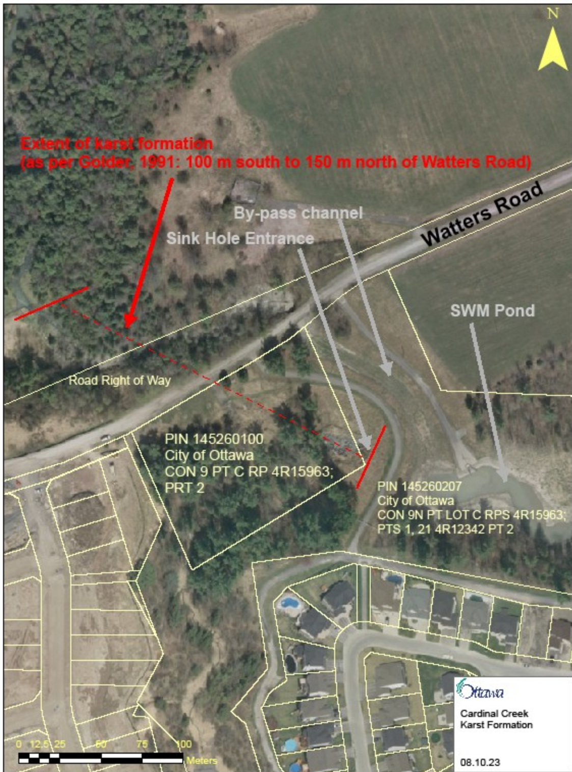
Figure 4. Cardinal Creek Karst ANSI boundary consists of the property line enclosing the City of Ottawa lands designated as PIN 145260100 (central portion of map).