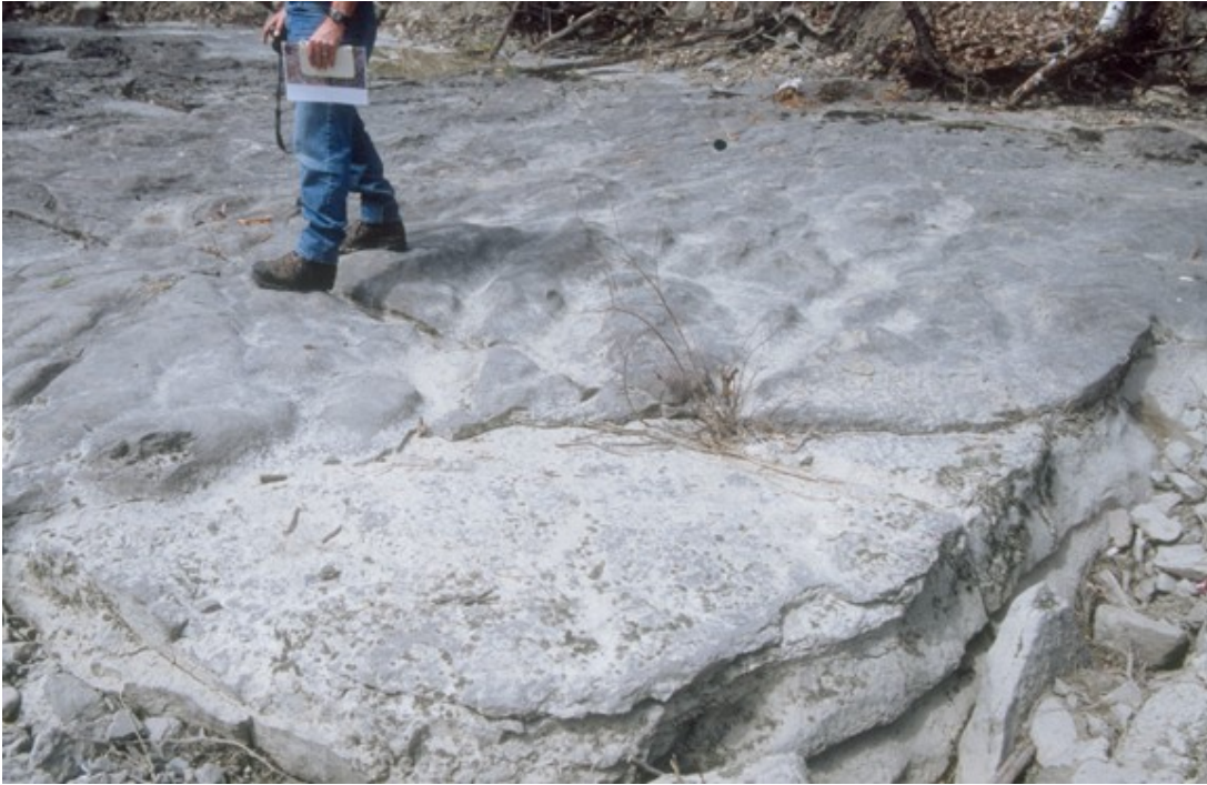
Figure 3. Water-carved surface of the Paleozoic limestone bedrock, above the first falls near the Watters Road bridge, within the City of Ottawa right-of-way lands.